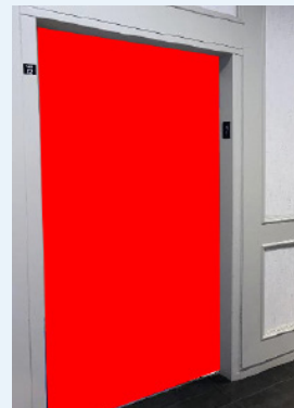
5 th and 7 th Floor Elevator Panels