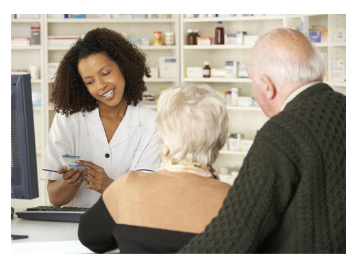
Figure 1 The Partnership Between Clinical Expertise and Business Operations in LTCI Allows for Care Optimization and Best Practices During Claims Processing

An example of a typical quality guideline may ask a patient to complete an X-ray for knee pain before ordering a more expensive test such as a magnetic resonance image (MRI). This practice leverages evidence-based protocols and allows the insurance company to "rule out" any obvious knee trauma before approving payment for a more expensive test, in this case the MRI.